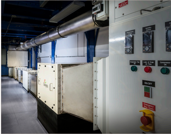
Entegris filter test wind tunnel.

The HVAC industry often tests filters at concentrations as high as 1000 parts per million (ppm, 10^{-6} ). Many AMC filter vendors test filters (or sometimes only adsorbent samples) at concentrations between 3 and 100 ppm. The ISO standard 10121-1:2014 suggests a range of 9 – 90 ppm, all far above real-world applications, which might be as low as a few parts per billion (ppb, 10^{-9} ), a factor of 1000 – 100000 below these test concentrations.