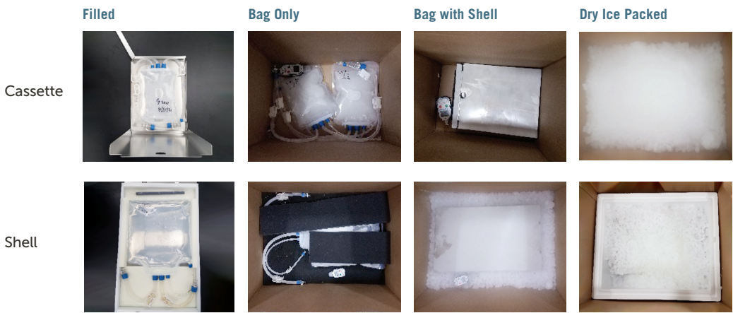
Figure 1. Shipping configurations

Images of the materials and configurations that were the subject of this study can be seen in Figure 1. Details of bag fill volumes, shipper size, and dry ice packing quantity are listed in the accompanying table.