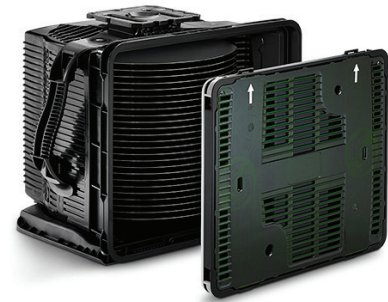
The Spectra FOUP, with advanced inert gas diffusion purge, protects wafers through hundreds of process steps.

These advanced FOUPs create a sealed wafer environment that provides static protection, white-light shielding, and offers a considerable positive impact on device yield.