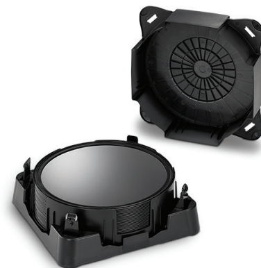
The SmartStack contactless HWS safely transports highly valuable and intricate finished wafers to their final destination.

Our HWS increases shipping density, which significantly reduces finished wafer shipping costs; and by addressing both edge defects and shipping damage our contactless design improves overall product yield. Protecting the purity, safety, and security of finished wafers is paramount since one wafer handling container of finished 300 mm wafers may be holding $750 thousand dollars' worth of technology.