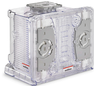
The FOSB's materials of construction and mechanical design maintain product purity through multiple wafer shipments.

Molded-in wafer supports set this FOSB apart from the competition with precise and permanent wafer plane positioning for the entire life of the product. The product's structural rigidity protects wafers against vibration and shock events, reducing the opportunity for particle contamination and wafer misalignment, helping to significantly improve the final process yield.